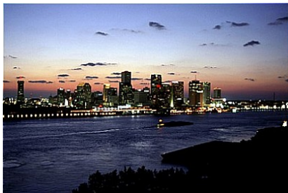
New Orleans skyline at night

This year's conference will feature four concurrent tracks: (1) Problem Analysis, (2) Tactical Analysis, (3) Technical Lab and (4) Special Topics. Stay tuned to the IACA website for more specifics on topics and speakers.