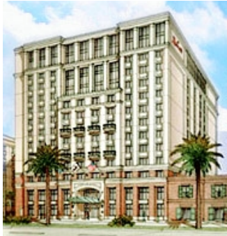
New Orleans Marriott at the Convention Center

The 2006 IACA Training Conference will be held at the New Orleans Marriott at the Convention Center. This brand new hotel is located in the Warehouse/Arts District, across the street